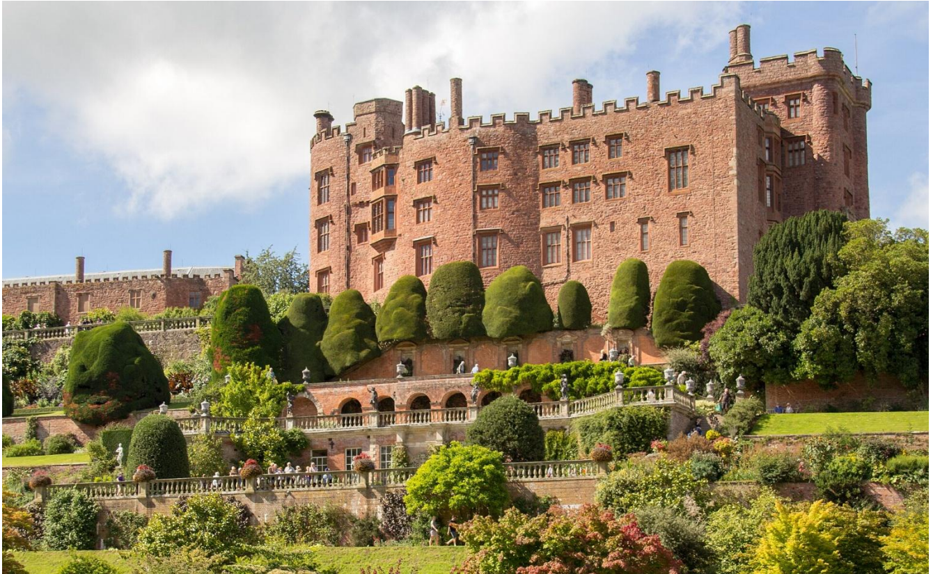
Powys Castle.

Today we had our June garden group trip to Powys castle near Welshpool. It was a good journey and the weather was fabulous. The castle is set on a hill and the garden is laid with terraces bordered by wide planted areas. There were many varieties of shrubs and herbaceous plants in flower and trees gently swaying in the light breeze.